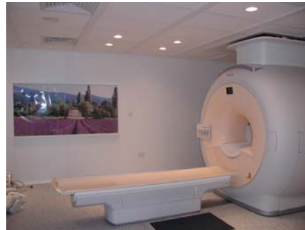
3T MR Scanner